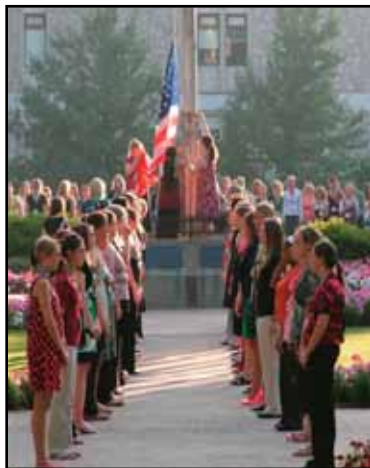
Proper Respect. Missouri Girls State staff members introduced the proper way to lower the flag on Sunday evening. [right] At Attention. Newly chosen city bearers stand at attention during the flag lowering last night. Proper flag etiquette is stressed upon at Girls State. [left]

-Inclement weather. The flag should not be displayed on days when the weather is weary.